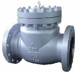
FIG. 278-CS-300 Class 300, Flanged ends, bolted cover, WCB body & cover, 13Cr/HF trim.

Flange dimensions: ANSI B16.5 Face-to-Face dimensions: ANSI B16.10 Testing: API 598 Design: API 600