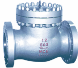
FIG. 278-CS-600 Class 600, Flanged ends, bolted cover, WCB body & cover, 13Cr/HF trim.