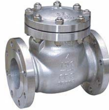
FIG. 278-CS-150 Class 150, Flanged ends, bolted cover, WCB body & cover, 13Cr/HF trim.

Flange dimensions: ANSI B16.5 Face-to-Face dimensions: ANSI B16.10 Testing: API 598 Design: API 600