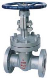
FIG. 272-CS-300 Class 300, Flanged ends, bolted bonnet, WCB body & bonnet, 13Cr/HF trim.