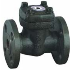
FIG. FSC-811F-150 FIG. FSC-811F-300

Design: API 602 – ASME B16.34 Testing: API 598 Flanges to: ANSI B16.5 Markings: MSS SP-25